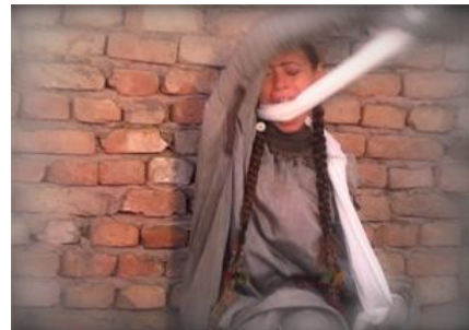
The video work of Jamshed Kholikov is on permanent view now in Behzod National Museum.